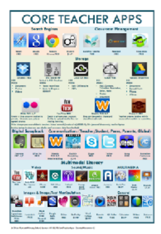
This chart is a list of Core Teaching apps available on most smartphones. It is a great start to discover what our students have available to them on their phones. Listed are search engines, classroom management apps, storage engines, digital scrapbook, communication apps, and multimodal literacy apps; with subcategories in video, multimedia, images & image/text manipulation.

Synchronous and Asynchronous Online teaching. One side of the chart describes Synchronous Face to Face meetings that meet once a week or twice for a whole lesson. Best Platforms are Zoom. Google Hangouts/Meet, Skype and Microsoft Teams. This type of teaching creates/fosters connection; it is easy to use to introduce & explain tasks, promote social integration and connection with everyone or small groups. You can also use it to help clarifying, by answering direct questions, misconceptions and lastly, provide immediate emotional support. The other side of the chart provides Asynchronous online collaboration. You can also use this once or twice a week, they can comment on things, and choose peers to work together. This is great for collaboration, projects that can last 2-3 weeks and peer/ groups feedback. Best Platforms are Moodle,, Google Classroom or Docs, Voicethred, and Bloggins platforms like wix, wordpress, etc. It can also work for Critical Thinking, where you post a prompt, and remotely people can reply, and others can reply but it is not done in real time. It can create visual thinking routines, guiding and inquiry questions.